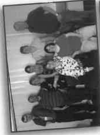
Our group, Action in Melton!