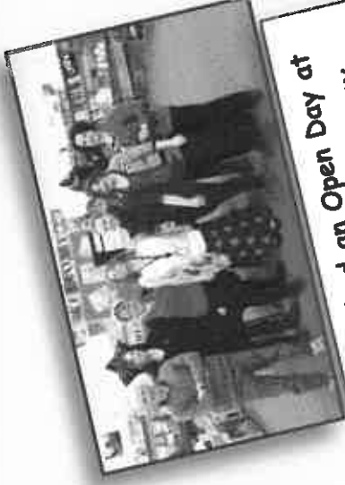
We had an Open Day at the Melton Mowbray

We meet every 8 weeks; the group is made up of people with learning disabilities, carers, friends, and people who work for community organisations.