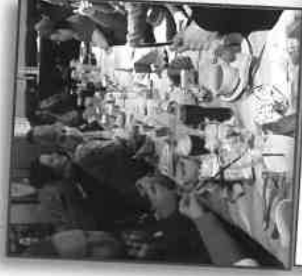
Having fun on our Christmas meal