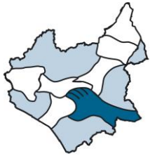
Leicestershire Learning Disability Partnership Board